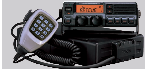
REMOTE MOUNT CONFIGURATION